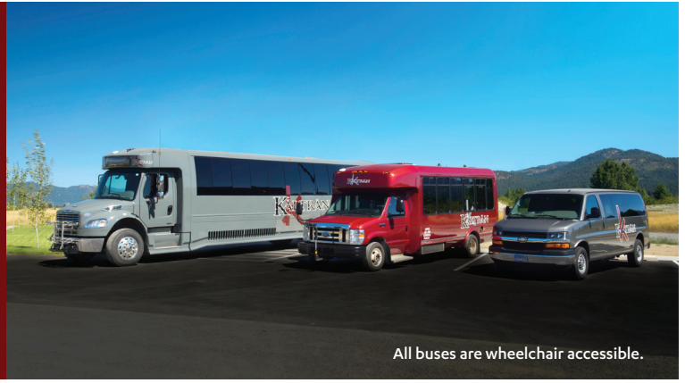
All buses are wheelchair accessible.